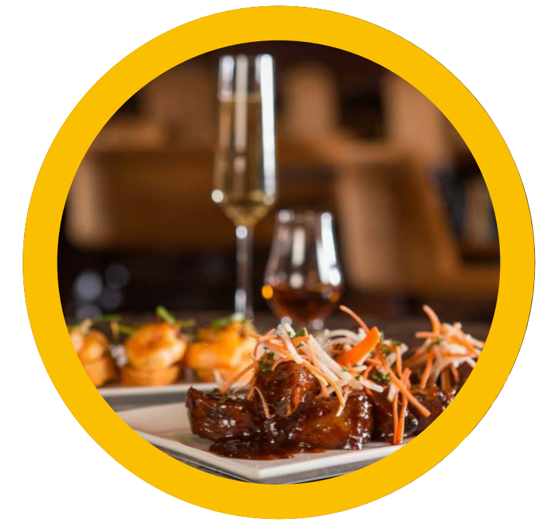
Food and Drinks